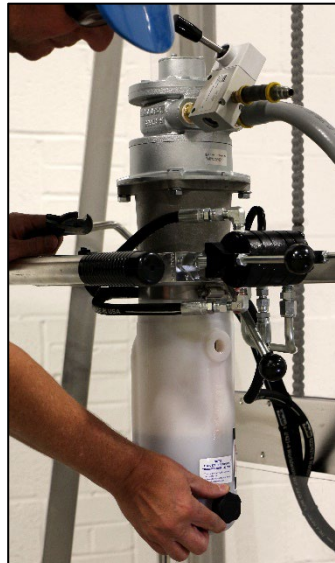
Remove BLACK breather from storage position