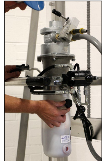
Install BLACK breather in place of RED shipping plug