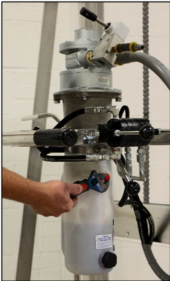
Remove RED shipping plug from the hydraulic reservoir